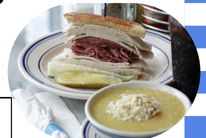
Soup & Sandwich

We charge 3% to offset processing fees. 20% gratuity will be added to parties 6+