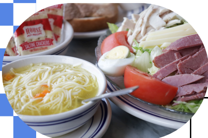
Soup & Salad