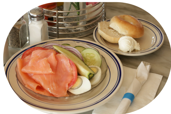
Nova Scotia Lox

seasonal fruit, add tuna or chicken salad +6.