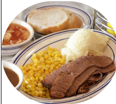
Hot Brisket Platter