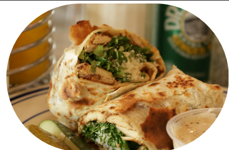
Chicken Caesar Wrap

We charge 3% to offset processing fees. 20% gratuity will be added to parties 6+